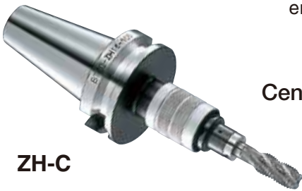
Center Through Tool Coolant

■ This fine floating tapping holder improves tap life remarkably by absorbing fine pitch error completely with the small floating mechanism.